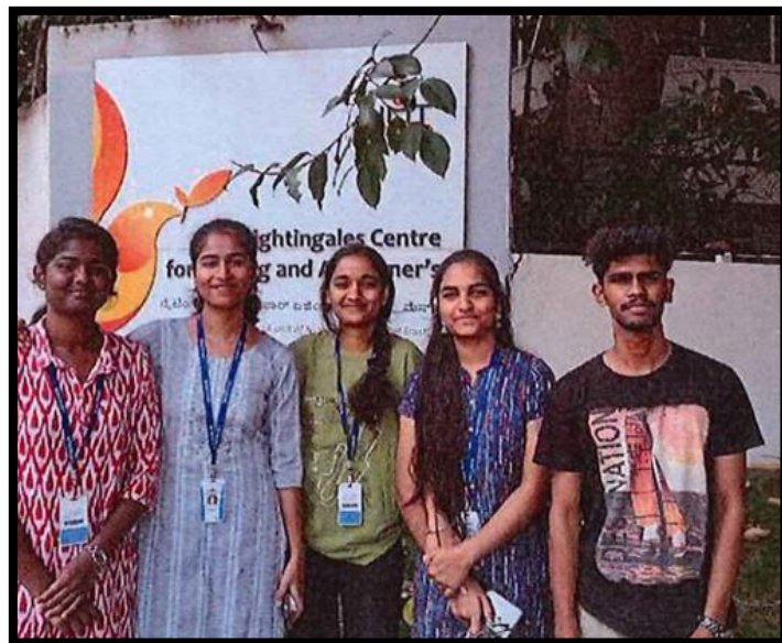
Field visit to Nightingale's Centre

The Dept. of Psychology and WEVOLVE Club organized a field visit to the Nightingales Centre for Ageing and Alzheimer's on 24 th August 2023 from 10 am to 1 pm to gain insights into the challenges faced by individuals with Dementia