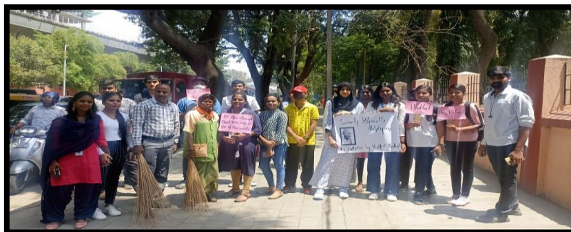
Swachh Bharat Abhiyan as part of Gandhi Jayanti Celebration