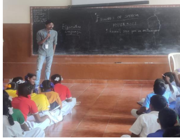
UG Students interacting with students of Resurrection School