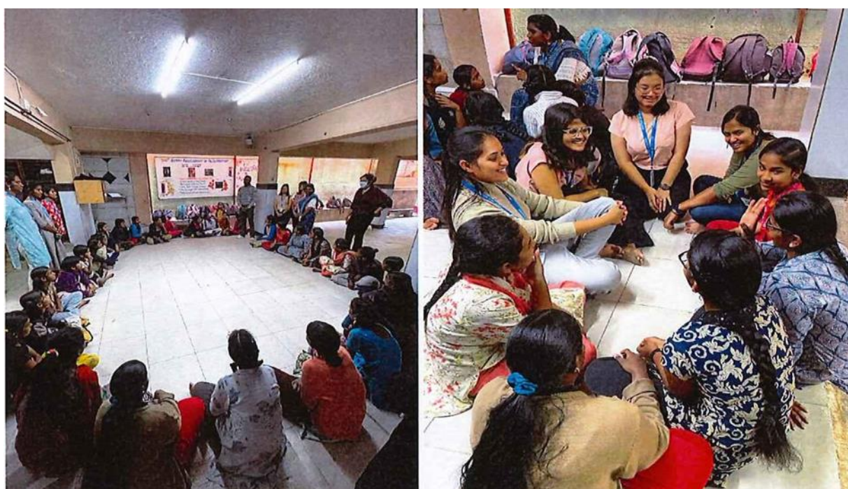
NSS Volunteers conducting activities for Ashadeep Home children

The National Service Scheme (NSS), Montfort College organized a visit to the Ashadeep Girls' Home, Shivaji Nagar, Bengaluru on 10 th March 2023. The visit included activities such as singing and dancing as well as NSS volunteers pooling money to donate chocolates and sanitary napkins to the residents.