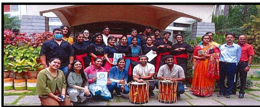
Students with faculty after conducting the street play

The UG and PG students of Montfort College came together to organize a street play to raise awareness for Mental Health Day, observed on October 10 th , 2022. The play was performed in front of Old Madras Road and enacted various scenarios comprising of bullying and loneliness during old age amongst others.